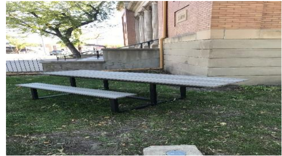
Our new Bench and Wheelchair accessible Picnic Table